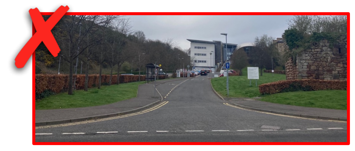
Main vehicle entrance to the Campus

It is NOT permitted to carry out any filming activities near the main vehicle entrance and exit to the campus.