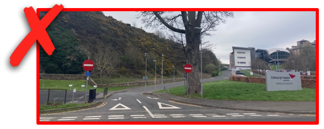
Main vehicle exit of the Campus