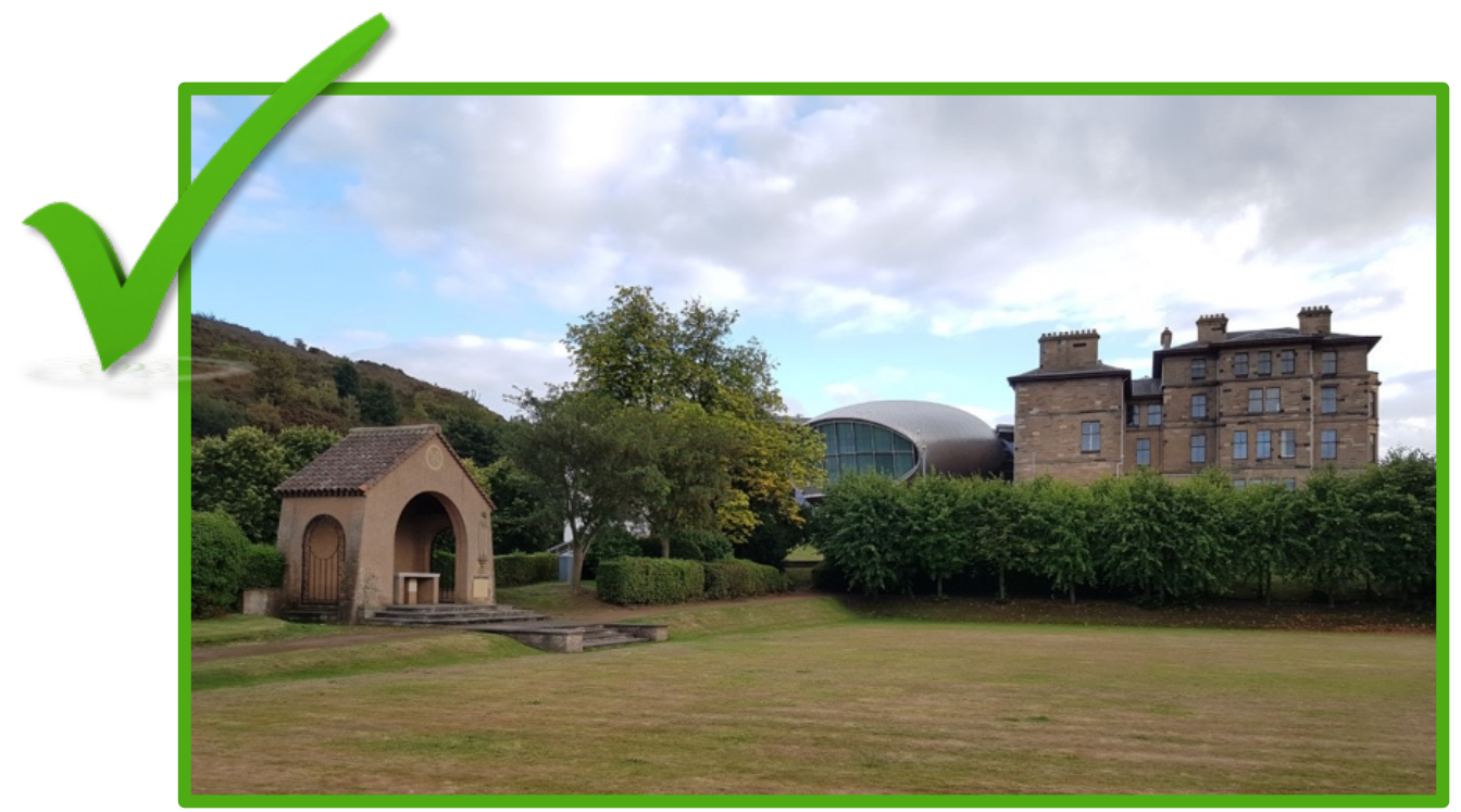
Same location during late summer

This Monument area can provide a good 'Park' setting. NOTE: - Various changes in level.