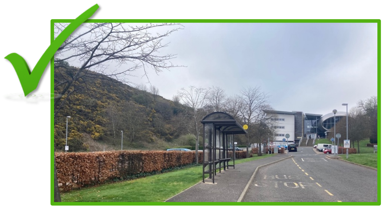
Bus Stop (not in use)

Bus Stop can only be used safely out of hours.