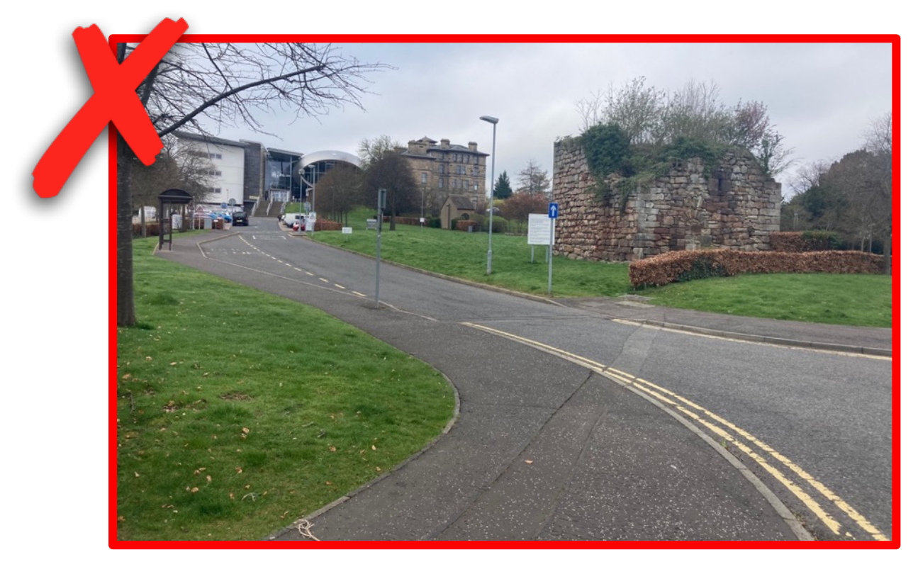
Main vehicle entrance to the Campus