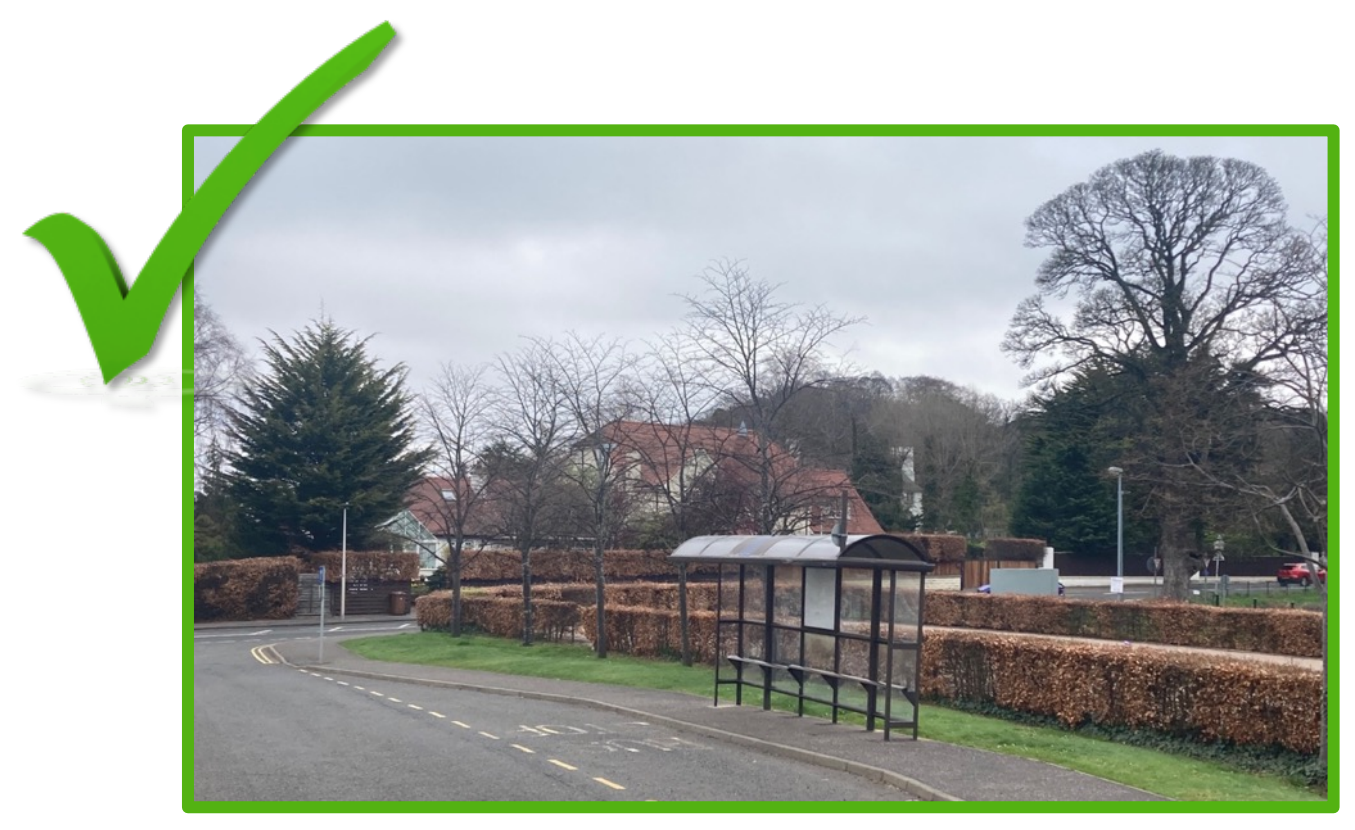
Bus Stop (not in use)

Bus Stop can only be used safely out of hours.