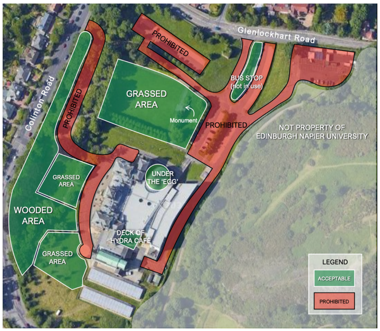
Figure: Aerial view of acceptable and prohibited filming areas